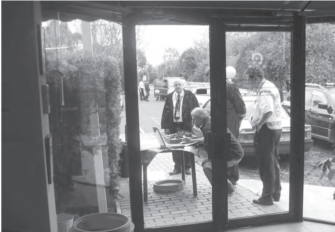
Maybe the lab of the future will look like this.

Given my current position, I have to say that many more matches are still found by fingerprints rather than DNA analysis - and much more cheaply.