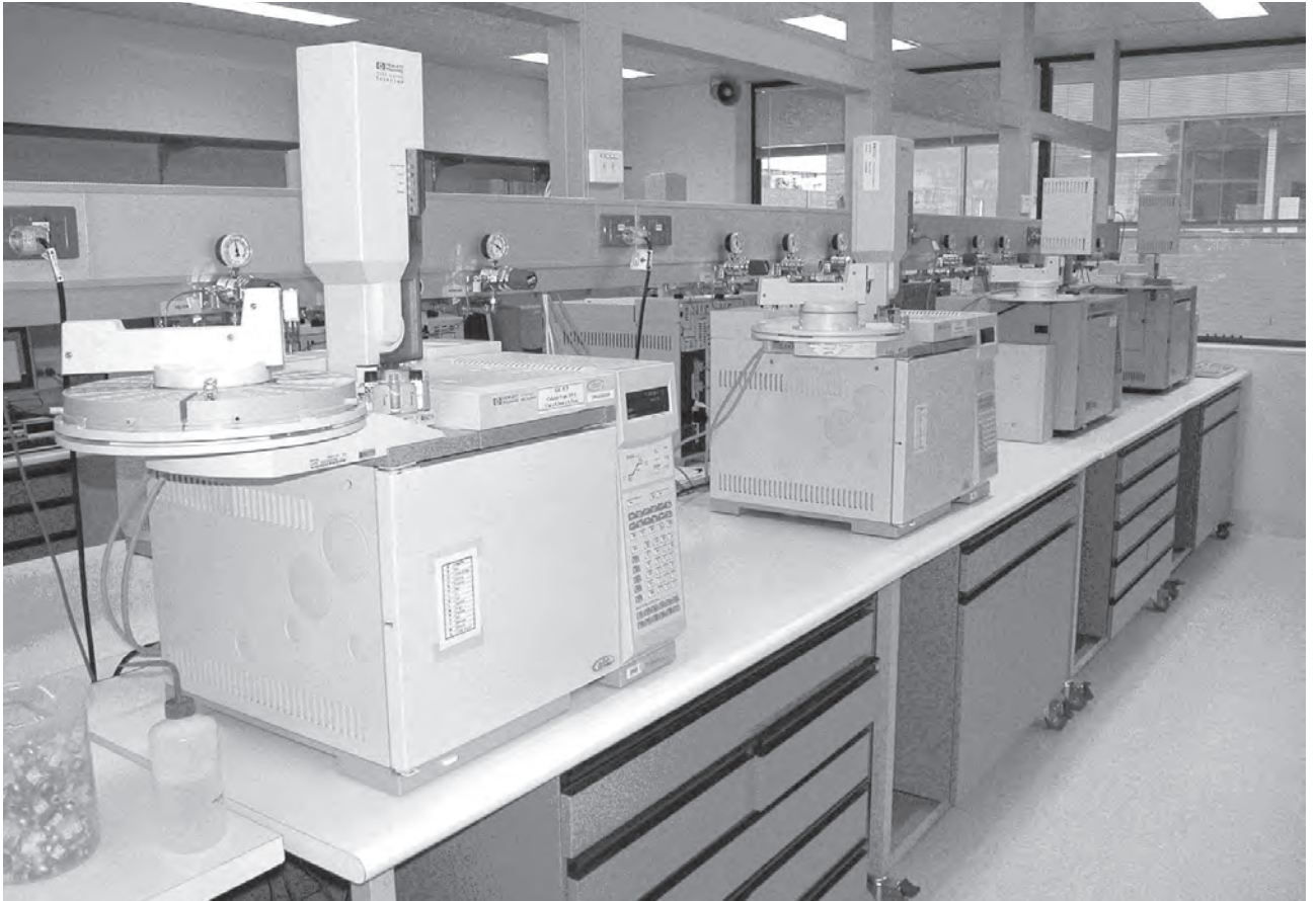
The lab of the present looks like this.

in Washington DC called Watergate. These days, quite sophisticated filters can be applied to enhance audio on analogue tapes. On the other hand though, it is getting quite difficult to get high quality analogue audio tape. Files are increasingly in digital format and a convergence between audio and video enhancement is happening. Even more possibilities arise for enhancement of digital files whether audio or video. Frames can be averaged to bring out a clear number plate; backgrounds can be eliminated to clarify the fingerprint and so on.