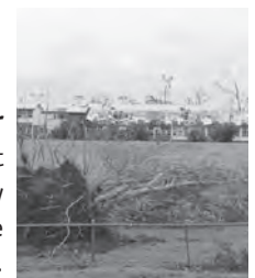
Front Cover Picture taken after Cyclone Larry hit Innisfail, Queensland. This tree, like many others, was ripped from the ground by the force of the strong winds.

Disclaimer Countrywide Media ("Publisher") advises that the contents of this publication are at the sole discretion of the National Emergency Response and the publication is offered for background information purposes only. The publication has been formulated in good faith and the Publisher believes its contents to be accurate, however, the contents do not amount to a recommendation (either expressly or by implication) and should not be relied upon in lieu of specific professional advice. The Publisher disclaims all responsibility for any loss or damage which may be incurred by any reader relying upon the information contained in the publication whether that loss or damage is caused by any fault or negligence on the part of the publisher, its directors and employees.