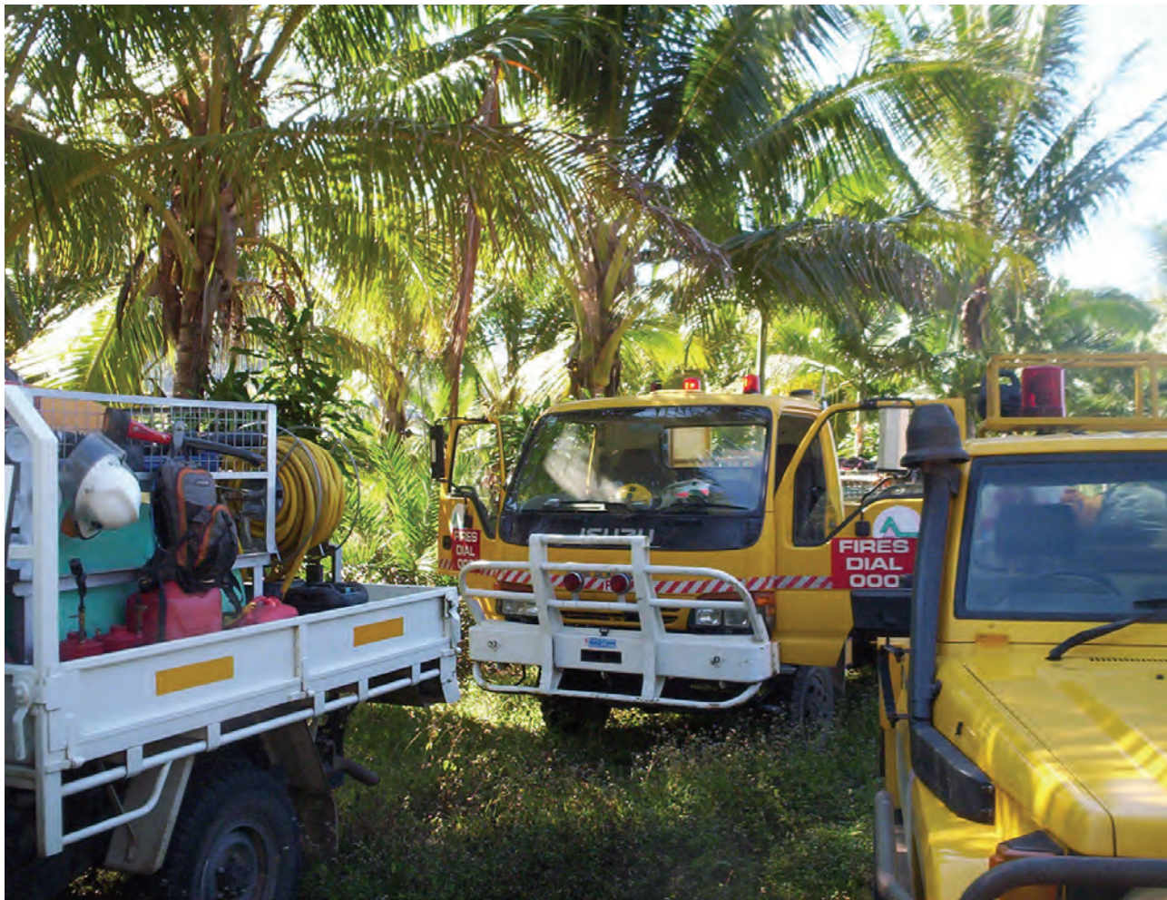
Rural Fire Brigades in Tropical North Queensland. Swaying palm trees et al, September 2006.

When you think of the tropics you normally think of palm trees swaying and inviting blue lagoons. It is the romantic honeymoon location or family getaway which people dream of. Many people don't realise that the tropics represent many unseen hazards and dangers which are inherent primarily to tropical climates.