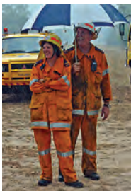
The first wet season rains put an end to this major fire at Black River and Bluewater, December 2005.

In the time we took to get to the medical centre, the casualty’s heart rate increased, he had shortness of breath, he felt like his chest was being crushed, he became extremely irritable and lost consciousness 3 times. His body temperature had certainly gone up rapidly and his