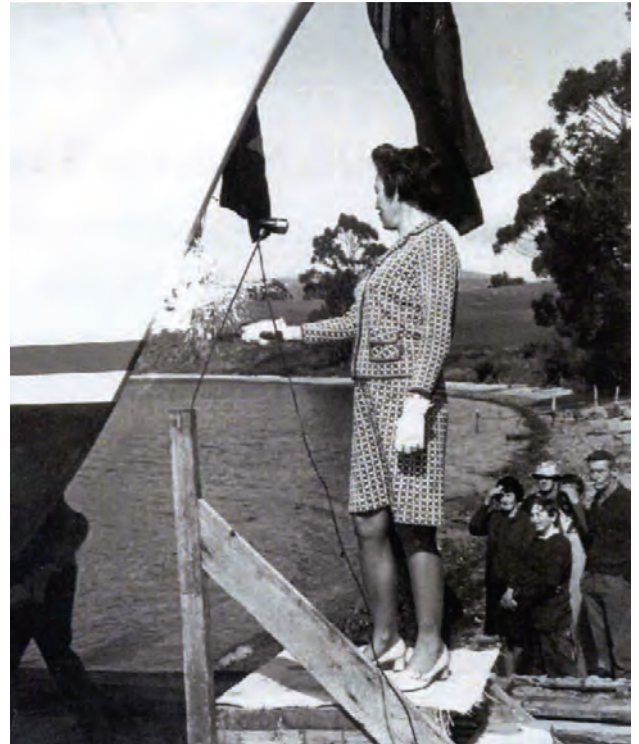
Left: The Police vessel 'Vigilant', after 35 years of service.