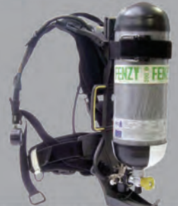
FENZY "X-PRO" Breathing Apparatus