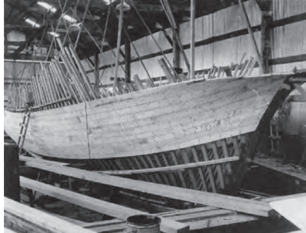
Left and above: 'Vigilant' under construction.