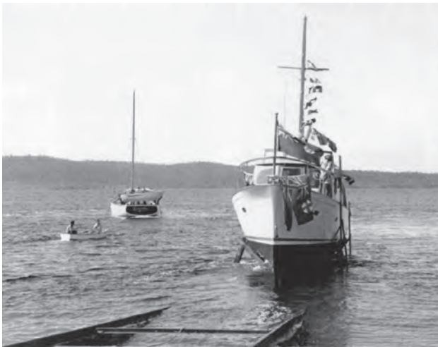
Above: The official launching of 'Vigilant' in 1971. Right: 'Vigilant' under way.