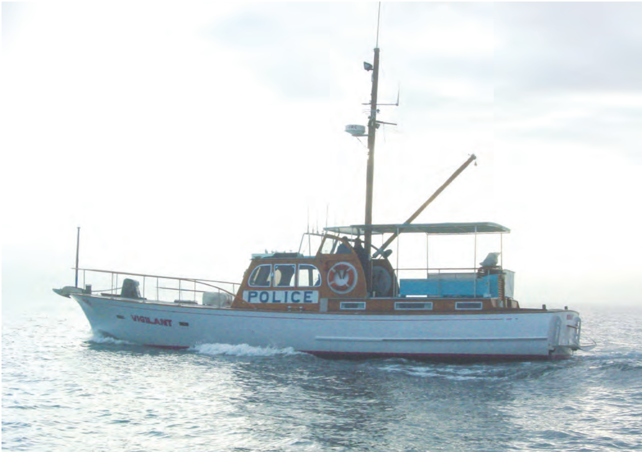
The strong and ever faithful 'Vigilant' still sails proudly today.

September 18, 2006, was an important date in the maritime history of the Tasmania Police, being the day that the Police Vessel 'Vigilant' completed 35 years of service.