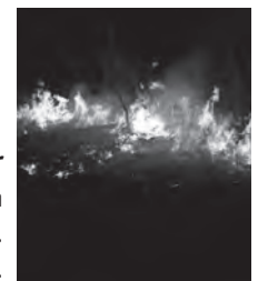
Front Cover Bushfire during a Hazard Reduction at Rollingstone, North Queensland.

Disclaimer Countrywide Media ("Publisher") advises that the contents of this publication are at the sole discretion of the National Emergency Response and the publication is offered for background information purposes only. The publication has been formulated in good faith and the Publisher believes its contents to be accurate, however, the contents do not amount to a recommendation (either expressly or by implication) and should not be relied upon in lieu of specific professional advice. The Publisher disclaims all responsibility for any loss or damage which may be incurred by any reader relying upon the information contained in the publication whether that loss or damage is caused by any fault or negligence on the part of the publisher, its directors and employees.