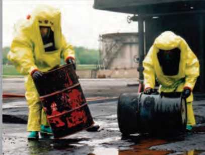
RESPIREX "ULTIMATE BARRIER" Gas Tight Suits