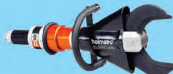
HOLMATRO "CORE" Single Hose Rescue Tools