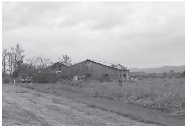
Photos from Innisfail after Cyclone Larry struck.

The following personal comment accompanying the report vividly illustrates the carnage done to this, one of Australia's most beautiful and scenic tourist areas: