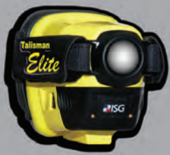
ISG "ELITE" Thermal Imaging Cameras