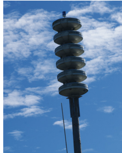
All Hazards Alert Broadcasting siren, used for tsunami and other alerts in Washington State, USA.

The public will have to rely on existing infrastructure in the meantime.