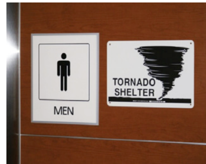
Shelter sign at Kansas City International Airport. The toilet is below ground.

Amongst the general public, the majority of residents had little idea there was a threat of severe weather prior to Sunday 22 May. About half of those interviewed, reported learning of the possibility of severe weather in the hours leading up to the tornado. Just less than half reported their first indication of a severe weather threat was in the moments just prior to the tornado.