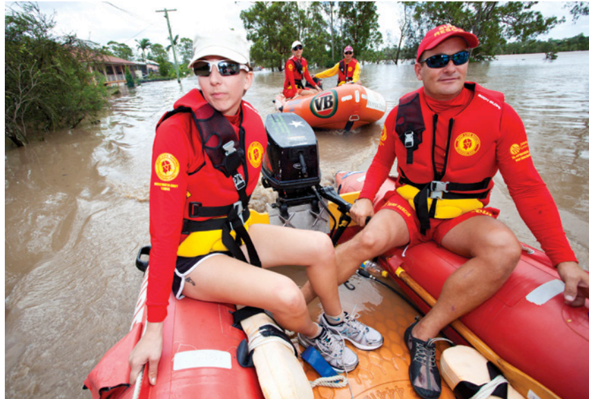
Surf lifesavers patrol Brisbane streets during the 2011 Queensland floods.

People were winched from roofs, verandas and from the ground as the waters continued to rise. They were transported to Bundaberg Airport where the 'red and yellow' army of surf lifesavers were on hand to assist them from the aircraft, administer first aid, help with food and drink or just be someone to talk to.