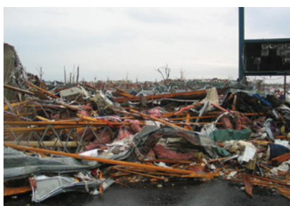
Joplin after the tornado.