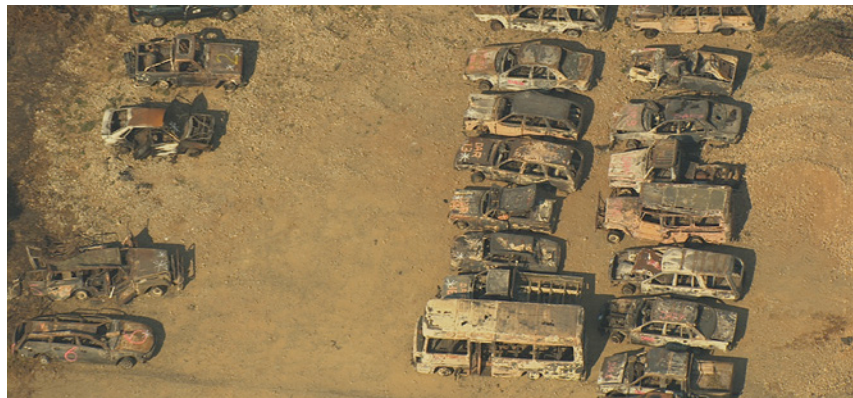
Burnt cars from the Black Saturday bushfires - a scene from The Earth Wins.

The film also has a message about the role of emergency service personnel in the aftermath of disasters and draws