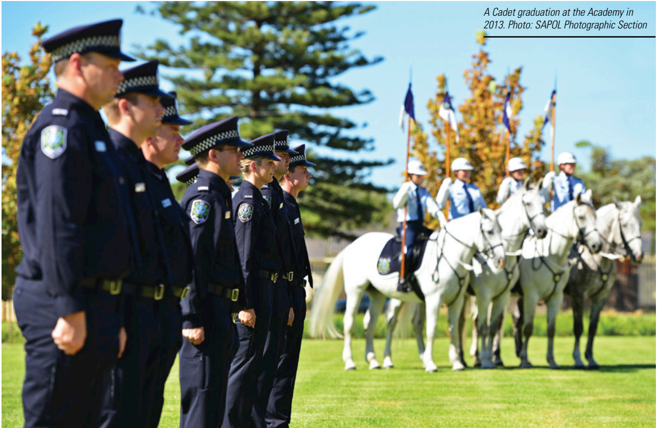
A Cadet graduation at the Academy in 2013.

This year, South Australia Police (SAPOL) is commemorating 175 years of policing in South Australia. With a strong and vibrant heritage dating back to 1838, SAPOL is the oldest centrally controlled police service in Australia, and one of the oldest in the world.