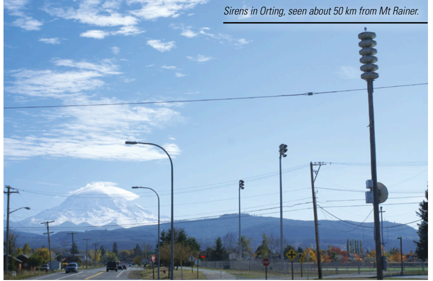
Sirens in Orting, seen about 50 km from Mt Rainier.

to throwing off catastrophic mudslides, known as lahars. It is usually referred to as America's most dangerous volcano although it last erupted in 1894, and there's no evidence of present volcanic activity. It is earthquakes generating lahars which are of more concern.