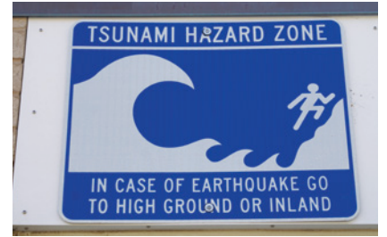
Tsunami warning sign on Santa Monica beach, California, USA.

The announcement begins with the heart stopping words: "This is not a drill."