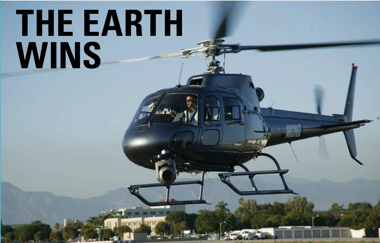
The Earth Wins film is shot completely from the air.

F ilmed entirely from the air across four continents, including Australia, The Earth Wins is a moving and visually beautiful film celebrating Earth's wonders and highlighting its fragility.