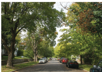
Typical Joplin street before the tornado.