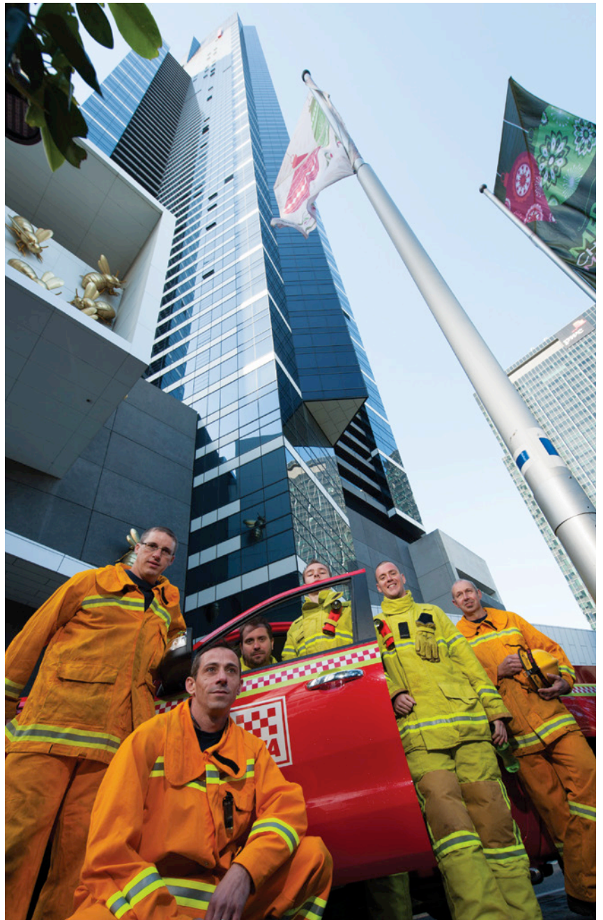
CFA team members who participated in the 2012 Eureka Climb Emergency Service Challenge, with the towering Eureka Building behind.

"I'm a firefighter and every year I want to compete wearing my firefighting gear," he said.