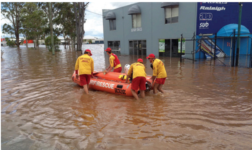
Surf lifesavers assist residents during the 2013 Bundaberg floods.

Opportunities abound for SLSQ volunteer surf lifesavers and lifeguards to attain many award qualifications, and levels within those awards, and many do. This is why surf life saving in Australia is one of the greatest humanitarian organisations in the world. The commitment from our volunteer surf lifesavers, both historically and recently, is the reason why we are on the beach saving lives and in our communities when natural disasters strike. ●