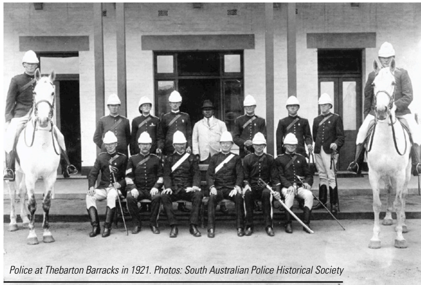
Police at Thebarton Barracks in 1921.

For historic photos, stories, and to stay up-to-date with 175 Year celebration events being held until April 2014, visit: www.sapolice.sa.gov.au