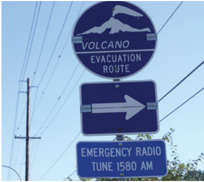
Evacuation signs in Pierce County.