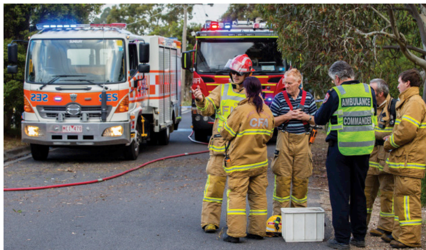
The AIES supports the men and women working as emergency services professionals or volunteers in Australia and New Zealand.