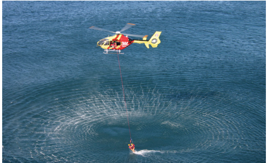
Westpac Lifesaver Helicopter surf rescue.

Volunteer surf lifesavers are well trained, giving up their own time to patrol our beaches and, at times, put their lives on the line to help people in trouble in our coastal waters. So it wasn't surprising that this selflessness also transferred to assist their local communities during times of natural disasters.