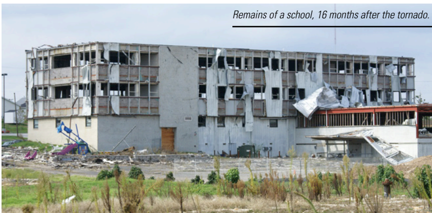
Remains of a school, 16 months after the tornado.

Australia is unlikely to ever be subject to an F5 Tornado. It is argued that there are some disasters which are so severe that deaths will always result and F5 tornadoes are in this category. Almost no buildings can withstand the wind and