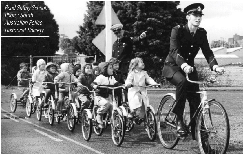
Road Safety School.