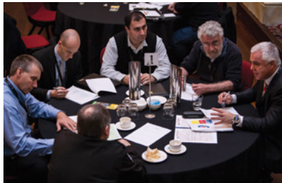
Conference delegates working together.

primarily individuals and families, local community, and the business, government and private sectors.