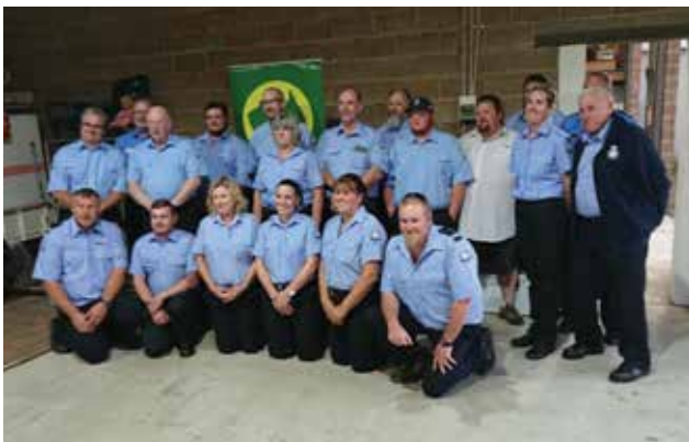
Members of the Derwent Valley SES Unit.